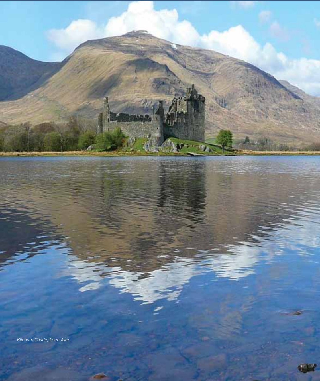
Kilchurn Castle, Loch Awe