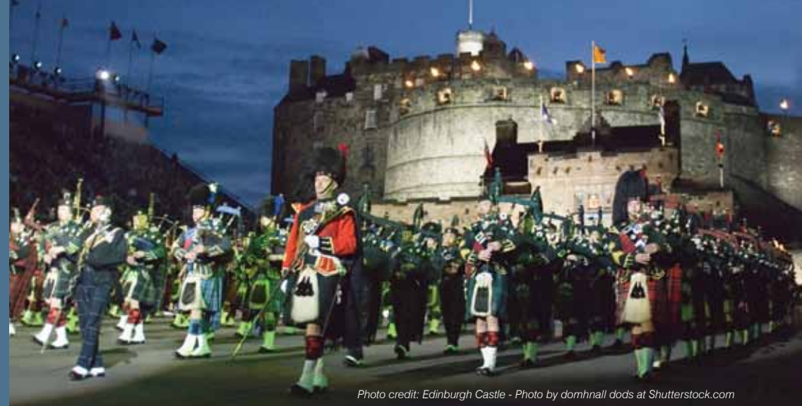
Photo credit: Edinburgh Castle - Photo by domhnall dods at Shutterstock.com

The programme will incorporate all the usual ECG based topics including acute myocardial infarction, familial arrhythmia syndromes, atrial fibrillation, modelling and implantable devices while it is the intention to organise a pre-conference guidelines workshop on "Early Repolarisation – Fact or Fiction".